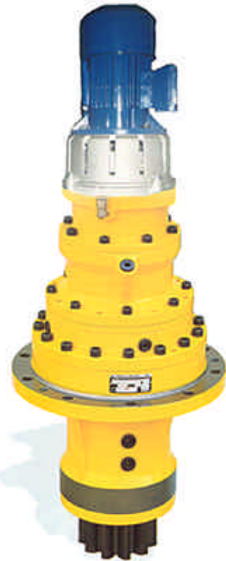
Fig. 3: A soft yaw drive with a yaw gearbox, a hydrodynamic coupling in an enclosure and an electrical motor with a brake.

A wind turbine rotor is exposed to a varying yawing torque due to the influence of both wind shear and turbulence. Due to the filtering effect of the rotor blades, the resulting yawing torque variations have prominent 3P or 2P elements, depending on the number of blades. With the soft yaw drive this results in a rocking motion of the nacelle, indicating that the varying yaw moment is absorbed as a damped motion rather than as pure torque. A typical amplitude of this motion during a high wind speed, high turbulence situation is \pm 0.1 degrees, which is small, although enough to give a significant load alleviation. Besides the hydraulic damping effect of the coupling, also the inertial forces help to redistribute the energy flow and thus reduce the movements. In Fig. 1 the inertia is marked as a separate element, although it in reality appears in the coupling housing, when the coupling is oriented as indicated. In absolute terms the inertia of the coupling is small. However, in the same way as the damping, its effect on the system is increased by the yaw gear ratio squared. This means that it has about the same impact as the inertia of the nacelle and turbine combined. In fact, when designing the system one has to safeguard that the inertial effect of the coupling does not get too large, since it then will deteriorate the intended performance.